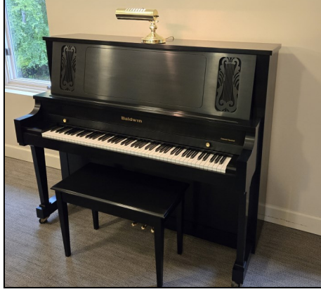
A rainy day move.